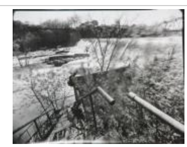
Old Mill Dam Behind Karause's, The Esopus, Saugerties, NY (20112340)