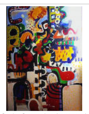
On the Connecticut (19860976)