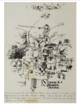
O Come All Ye Faithful! (19941104)