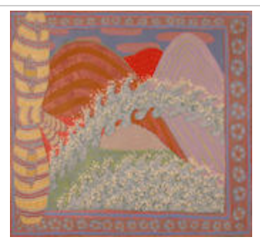
Oriental Window / Wave (19981250)