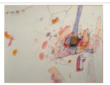
One Without The Other Two Is Like Two Without The Other One (19780566)