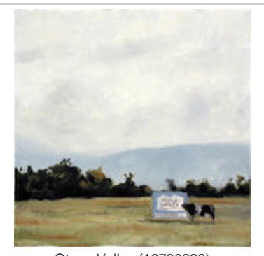
Otego Valley (19730228)