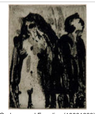
Orpheus and Eurydice (19981283)