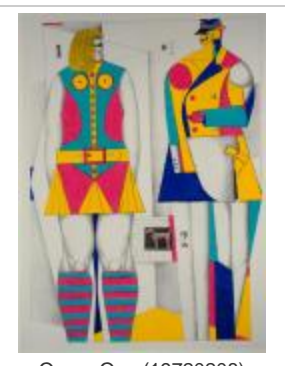
One + One (19720208)