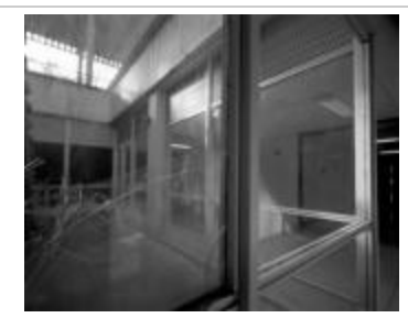
Old Light Well, University at Albany (20112343)